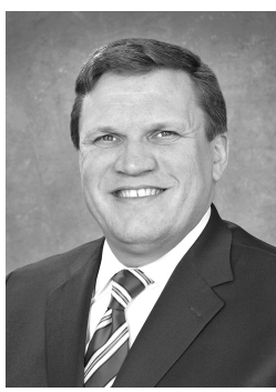
State Senator Wayne Schmidt

LANSING — Last week State Sen. Wayne Schmidt co-sponsored a resolution formally opposing a recent Michigan State Waterways Commission (MSWC) recommendation that canoes, kayaks and other paddle vessels be subject to state registration fees.