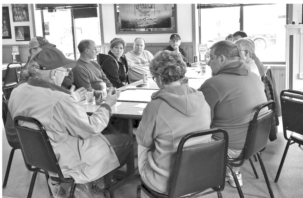
The first in the 2018 "Off the Cuff" series is scheduled to kick off this week in East Jordan.

Attendees will be able to hear updates from the three community leaders, as well as ask questions on a number of community topics. Coffee, tea, smoothies and pastries are available for attendees to purchase from North Perk Coffee. The series will continue throughout the year at various locations. Watch our web-